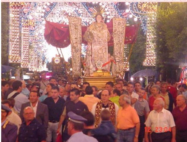
Miraculous statue of St. Philomena in procession for the feast day in Aug.

Once the Sacred Relics of St. Philomena had been enshrined at the Church of Our Lady of Grace, Mugnano del Cardinale on the 10th August 1805, it was decided that a feast should be held in her honour on that day every year. The very first feast day celebrations were to be held on the 10th Aug. 1806, a great procession had been planned to add greater solemnity... cont. page 2